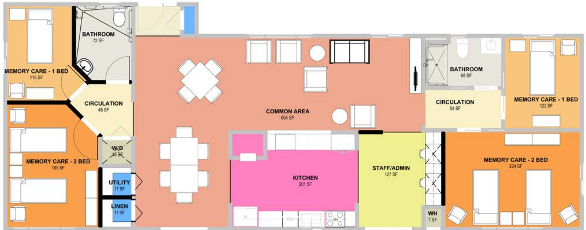
Phase I - Memory House