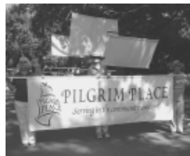
Pilgrim Place residents participated in Claremont's 4th of July parade.